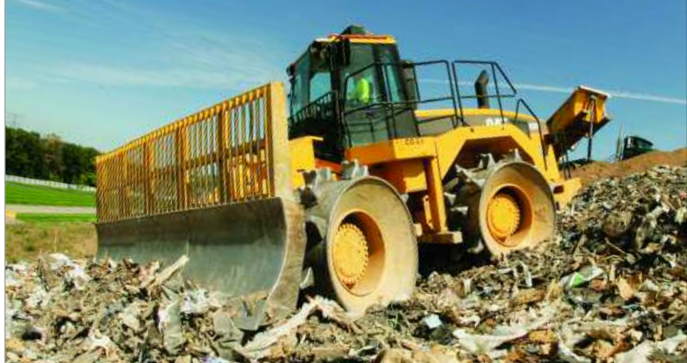
Just 30 minutes northwest of Minneapolis, Vonco II is a fully-permitted construction and demolition debris landfill with onsite recycling and aggregate operations. Serving direct haul volumes and walking floor trailers.

Vonco II also features onsite recycling services, so you can manage your waste stream responsibly — and earn waste recycling points. We have one of the region's highest recycling rates.